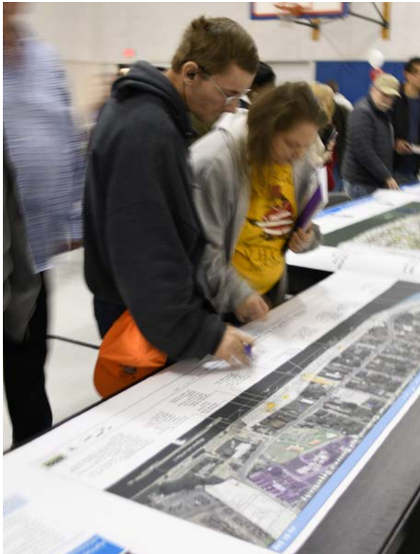
Residents at the second public meeting consider elements of a riverfront improvement plan for Natrona and add comments