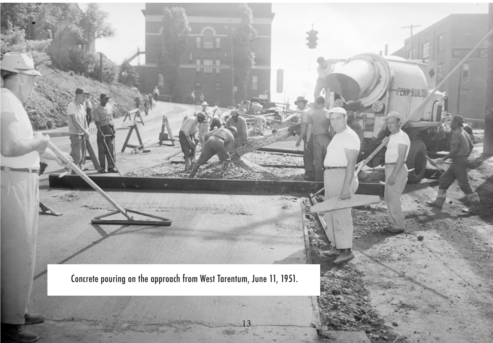
Concrete pouring on the approach from West Tarentum, June 11, 1951.

Also available at Word Association Publishers, and Amazon.